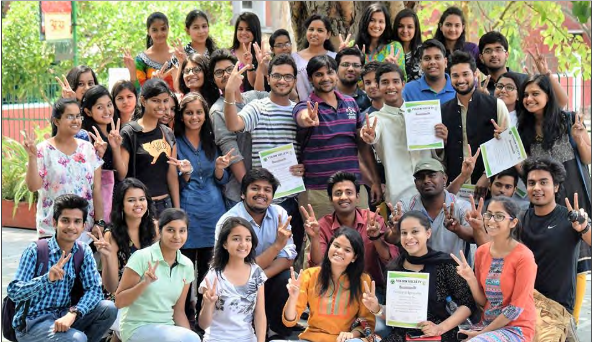
*many more members