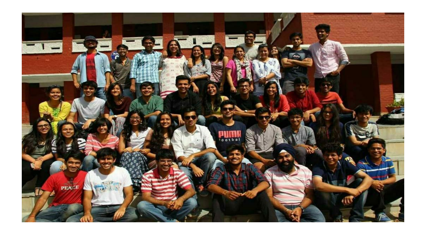
Event 3: We also helped conduct a conventional debate competition which saw participation of students across the country and a beneficial exchange of ideas.

In every event we undertake, we believe in leading by example. We constantly organise sensitisation sessions to help create an inclusive atmosphere. We believe in working in a way that no one gets left behind. We also provide cash prizes and other lucrative awards to winners of our events.