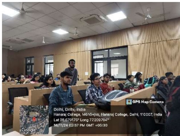
Audience asking questions