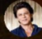
MR. SHAH BUKH KHAN Film Actor, Producer