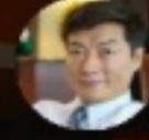
MR. LOBSAN G SANGAY Ex-Prime Minister, Tibet