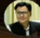
MR. KIREN RIJU Minister of State of the Ministry of Youth Affairs and Sports