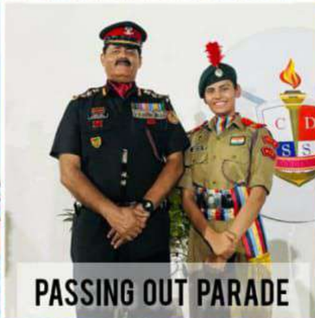
PASSING OUT PARADE