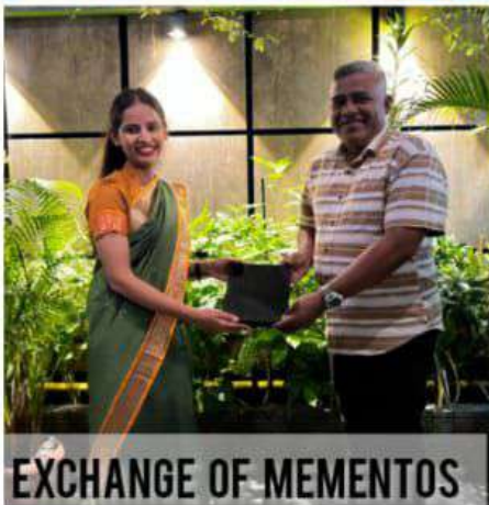
EXCHANGE OF MEMENTOS