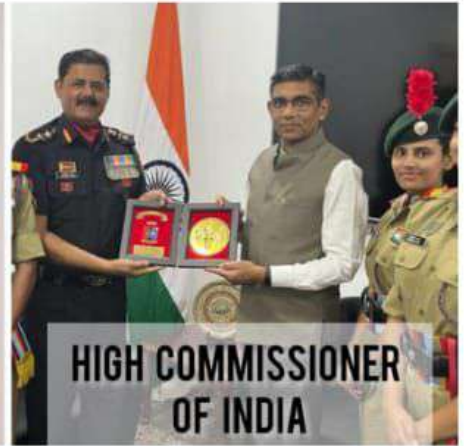
HIGH COMMISSIONER OF INDIA