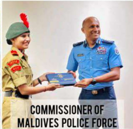
COMMISSIONER OF MALDIVES POLICE FORCE