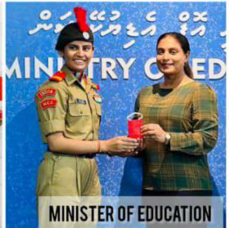
MINISTER OF EDUCATION