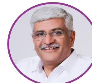
Shri Gajendra Singh Shekhawat Hon'ble Cabinet Minister Government of India