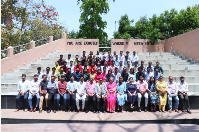
यज्ञशाला एवं वी.वी.आर.आई. केंद्र

सकते हैं। छात्रवर्ग इस मंच का उपयोग सांस्कृतिक एवं अकादमिक प्रतियोगिताओं हेतु कर सकते हैं।