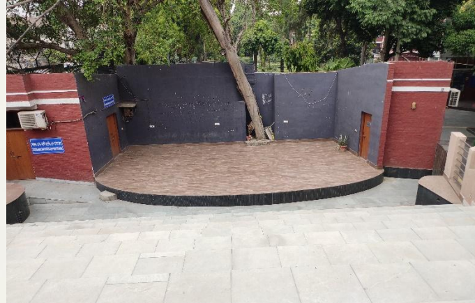
Yagyashala and VVRI centre

events such as choreography, plays, skits etc. Students also use this platform for their cultural competitions etc.