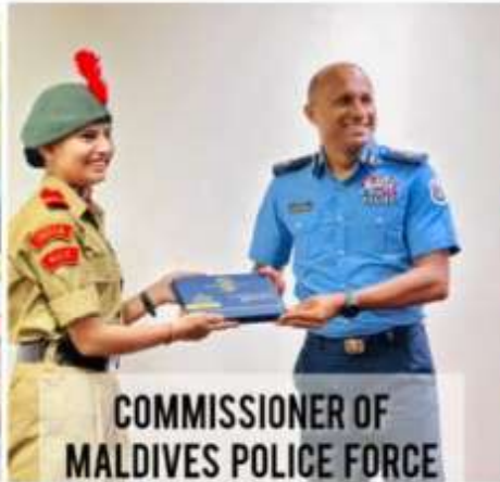
COMMISSIONER OF MALDIVES POLICE FORCE