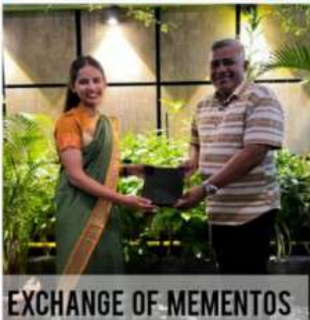
EXCHANGE OF MEMENTOS