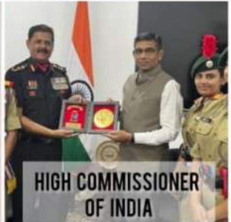
HIGH COMMISSIONER OF INDIA