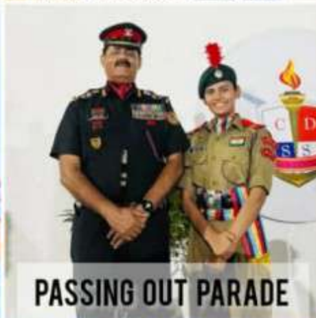
PASSING OUT PARADE