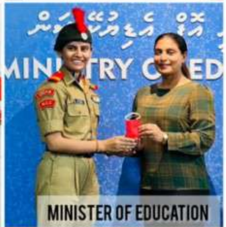
MINISTER OF EDUCATION