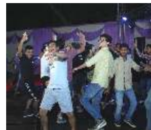
Fresher Party 2018