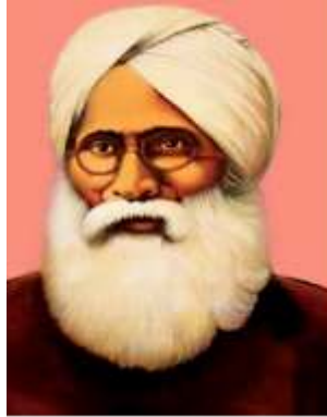
Mahatma Hansraj (1864-1938)

fo | ; k· èrè' uꣳs Knowledge Bestows Immortality