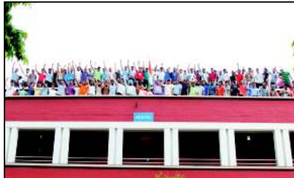
Independence Day Celebration 2018