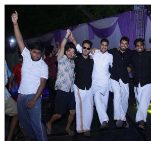
Farewell Party 2019