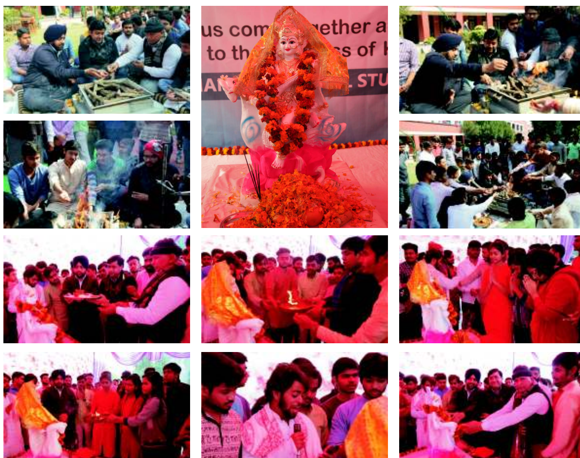
Saraswati Pooja Mahotsav 2019